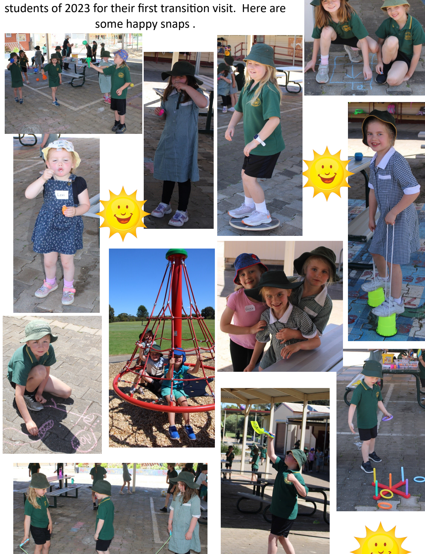
Bravery - Respect - Excellence - Mindfulness - Enthusiasm - Responsibility

The sunshine was out and we welcomed the Reception